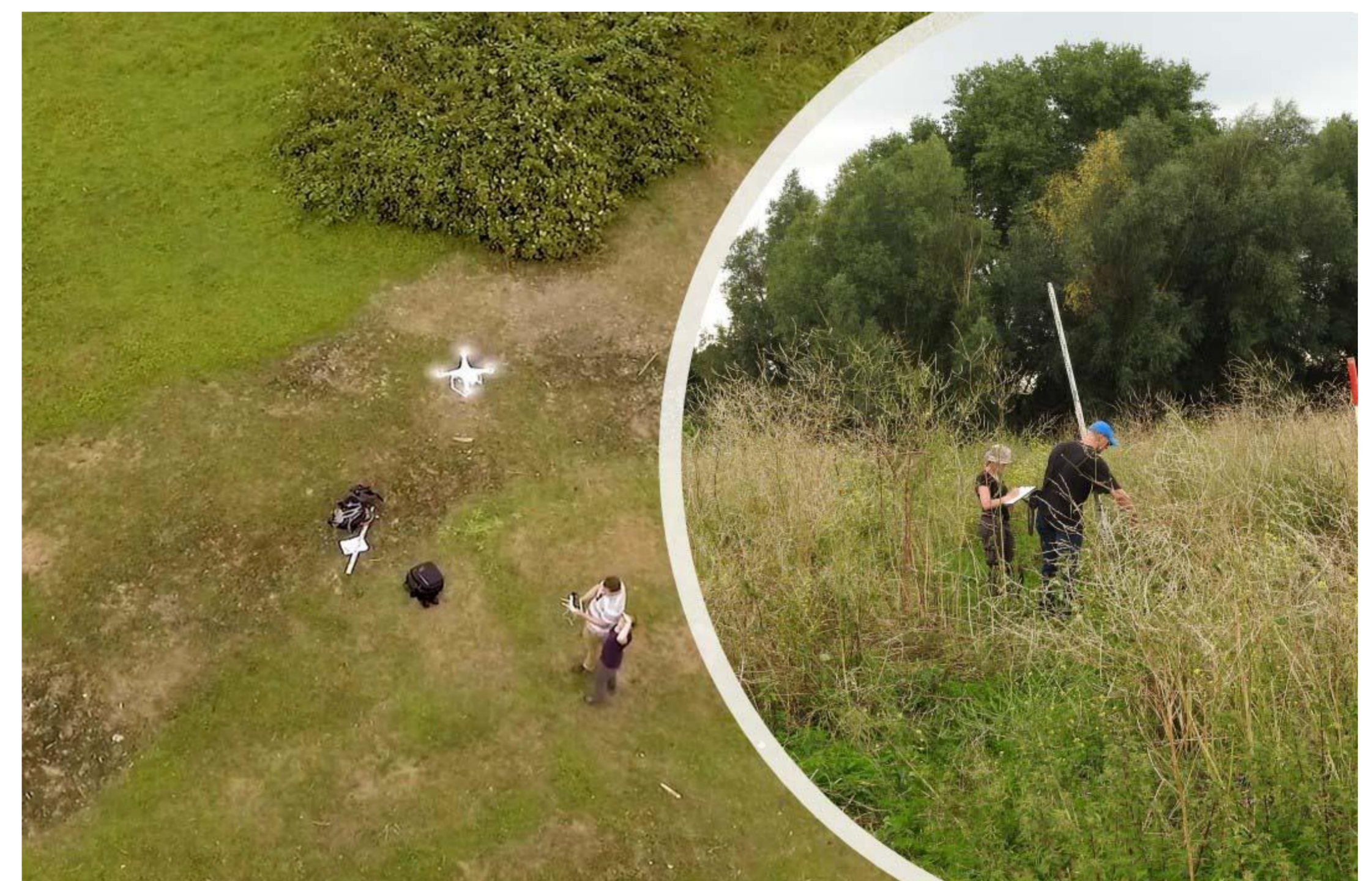
Fieldwork involving image acquisition and field measurements

Tests at other locations and contexts using new sensor types to widen the field application of the developed methods.